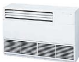
Floor standing cabinet