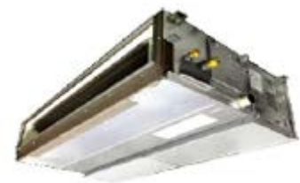
Concealed duct high static pressure