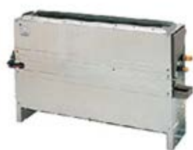
Floor standing concealed