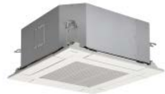
New Compact 4-way cassette